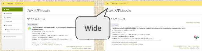
The screen after pressing the button